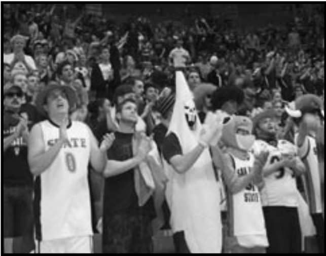
Fans always support their team.