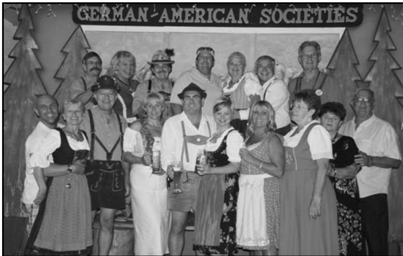
Oktoberfest committee. German-American Societies of San Diego Oktoberfest is located at 1017 S. Mollison Avenue, El Cajon (from San Diego, I-8 East, take Mollison Avenue exit south). Website www.OktoberfestElCajon.com . Or call (619) 442-6637 for more information.