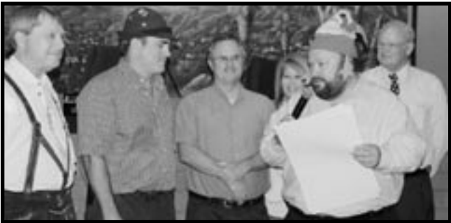
The German-American Societies Oktoberfest was recognized by the City of El Cajon and October was proclaimed as “German-American Month.”