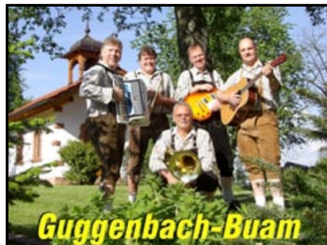
Guggenbach-Buam band will be performing at this year's Oktoberfest presented by the German-American Societies of San Diego Oct. 2-4 and Oct. 9-11.

Oct. 17: 5th Annual Smokin' in the Park , 10 a.m. - 10 p.m. Event is free. The 5th Annual Smokin' in the Park BBQ event is an annual event held that brings together