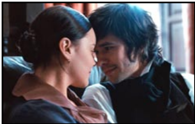
Abbie Cornish and Ben Whishaw.