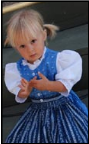
Never too young to dance.

5:00 pm Traditional German and Bavarian folkdances by the Gemütlichkeit Alpine Dancers 5:15 pm Kids Pitcher Holding - Cheer on our future bartenders during four exciting rounds of pitcher holding! Four events: Boys and Girls ages 6-9 and 10-14 6:30 pm Raffle Drawing and Contest Adult Nail Pounding - Compete for great prizes and show off your carpentry! 8:00 pm GRAND PRIZE RAFFLE DRAWING – The winner will be drawn for the round-trip tickets for TWO to Germany (plus one week car rental - courtesy of Fleetridge Travel)!!!! Buy your raffle tickets early and feel the excitement waiting for your name to be called!