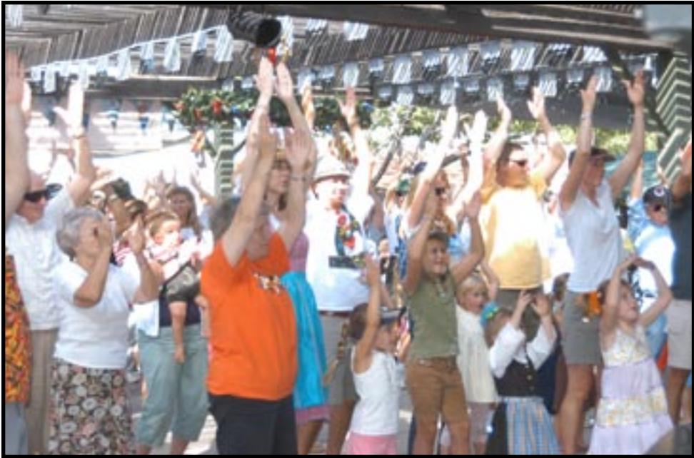
German American Societies of San Diego Diego Oktoberfest is full of fun, dancing, food and drinks.