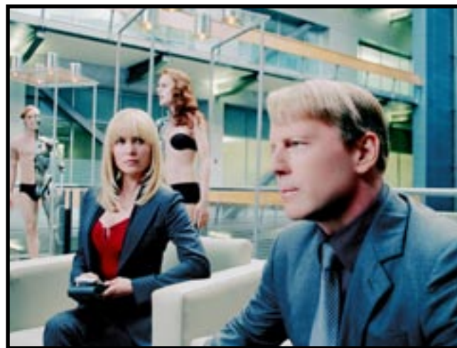
Radha Mitchell and Bruce Willis star in Surrogates.

From start to finish, the film moves at a slow unexciting pace. Most of the actors look plain but that's what robots are, and in the end this hurts the film since most moviego-