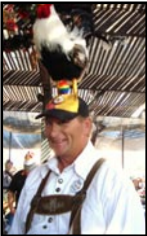
Getting ready for the Chicken Hat contest.