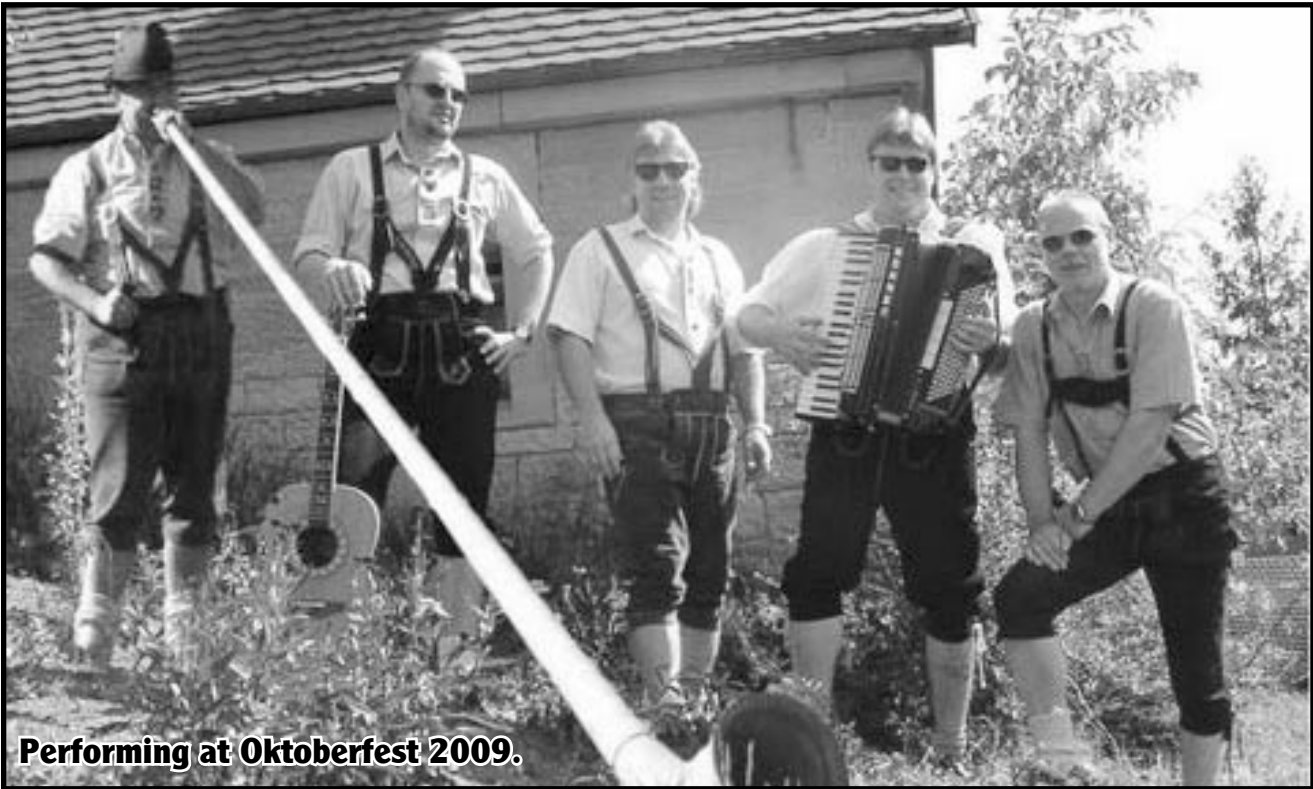
Performing at Oktoberfest 2009.

Call (619) 442-6637 for more information.