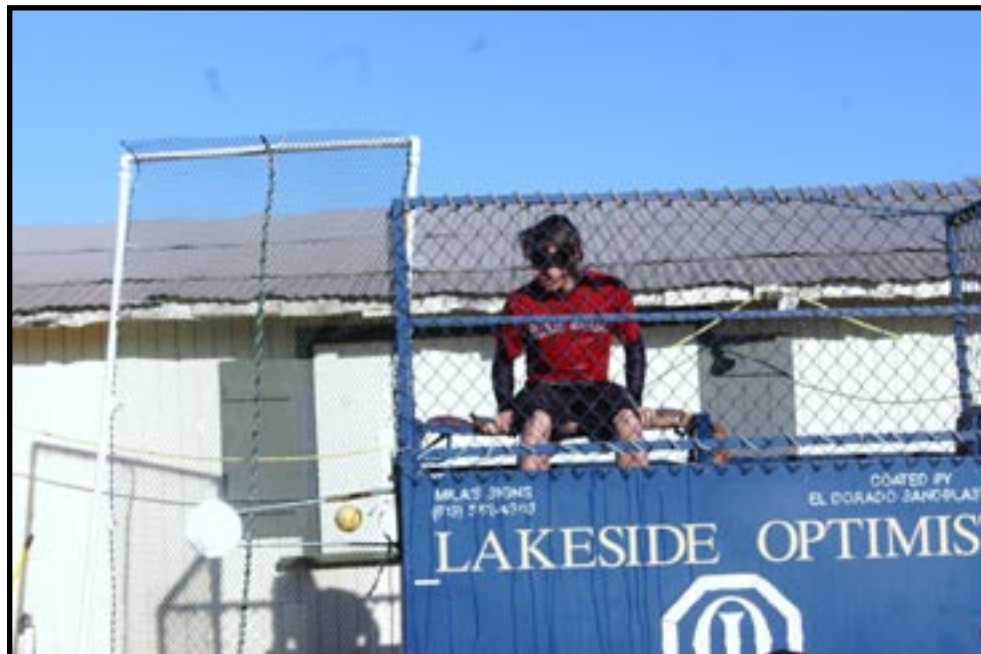
Dunking booth at Oktoberfest 2008. Dunkee watches ball as it approaches the target.