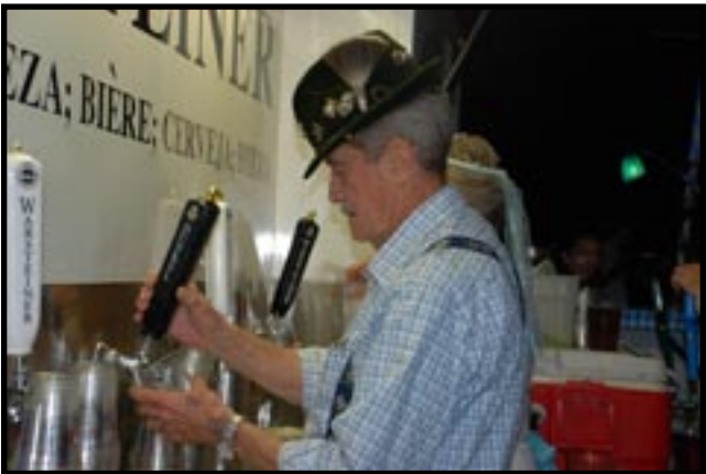
Serving the tap!

Schedule subject to change without notice