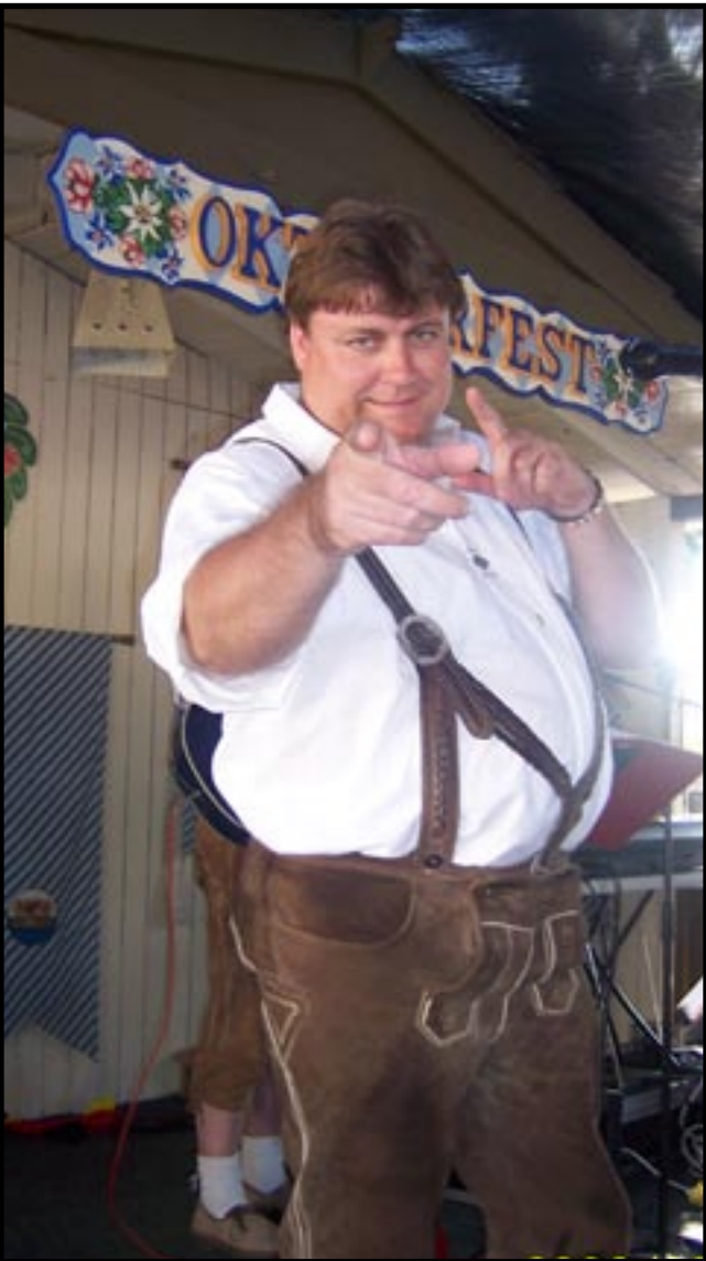
"We want YOU at the Oktoberfest!"