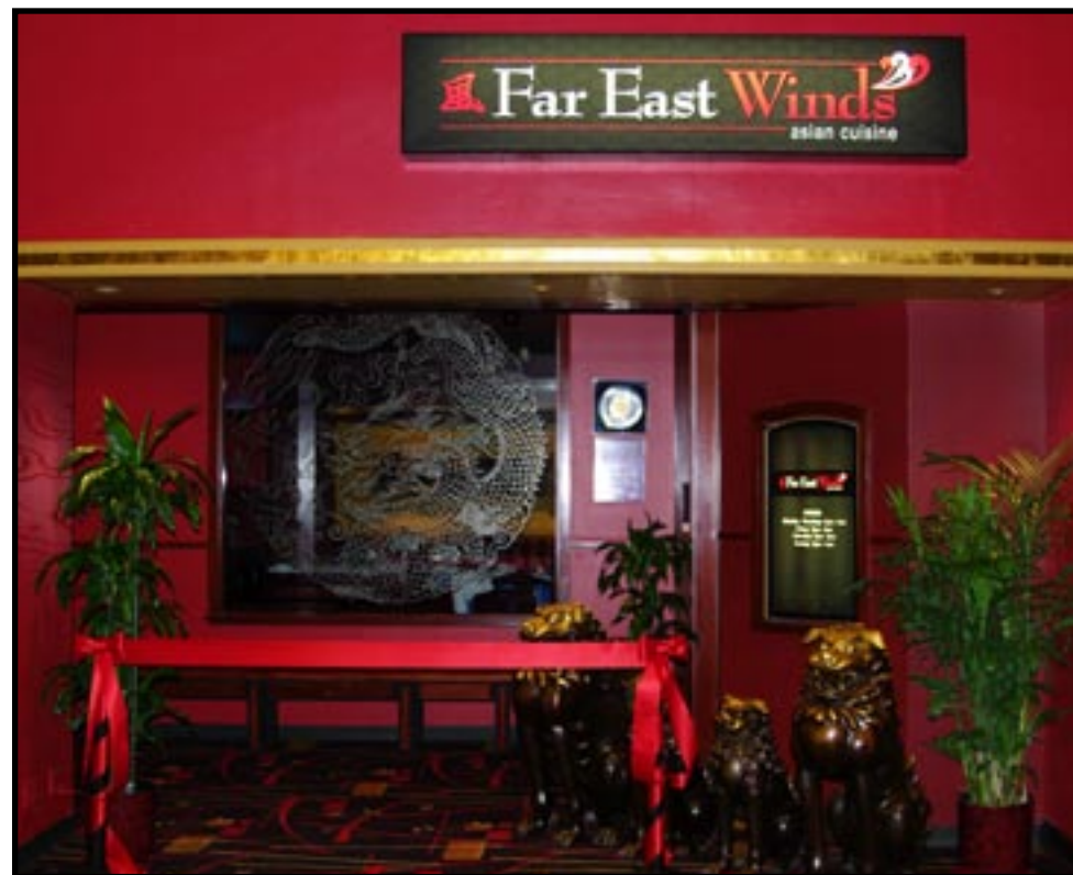
Far East Winds Grand Opening.

Maria was our exceptional waitress on the night our party dined. She was at our table within minutes of sitting and very attentive the entire night. We also enjoyed informative conversation with her about the restaurant and her suggestions and information about certain dishes. December specials at the Far East Winds are only $7.95 and offer selected entrees served