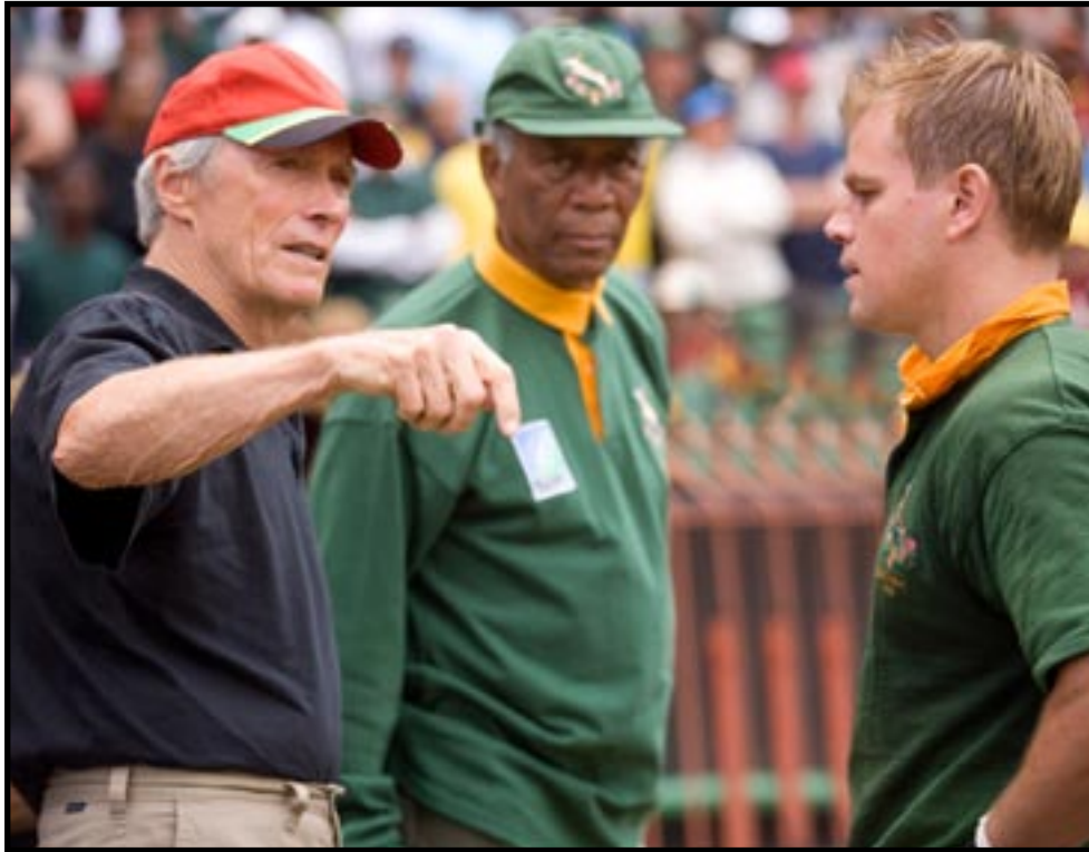
Director Clint Eastwood gives Morgan Freeman and Matt Damon advice in Invictus.