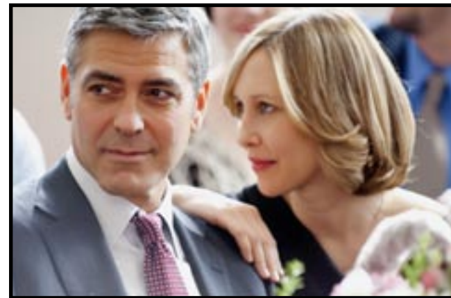
George Clooney and Vera Farmiga star in Up in the Air .