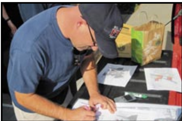
El Cajon Firefighter mapping out the danger areas.