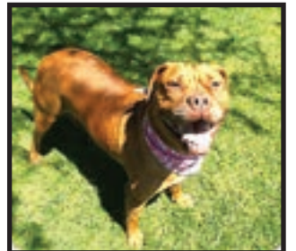
Lucy, 6-year-old American Pitbull female. Kennel #48