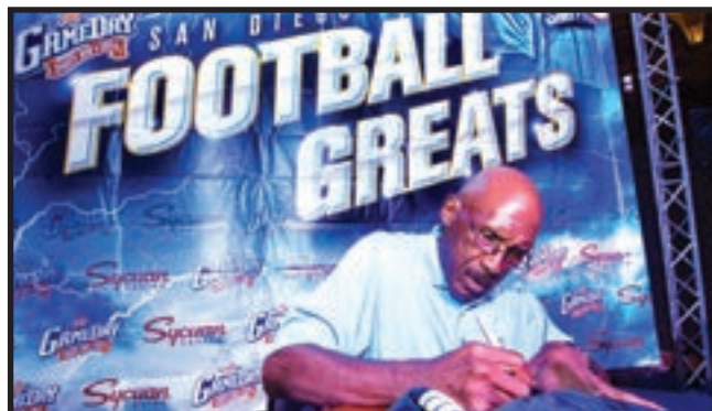
Charlie Joiner signing an autograph.