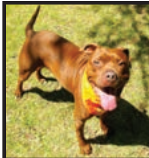
Ruby, 4-year-old Pit Bull female. Kennel #18

Single white male looking for love. Hi! My name is RUFUS. I'm a two-year-old Miniature Poodle with a great sense of humor and stunning good looks. I like snuggling, taking walks, and hanging out with friends (adult people and other dogs).