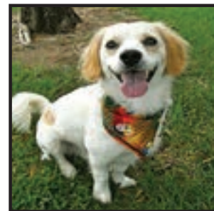
Sparky, 1-year-old Spaniel mix male. Kennel #61