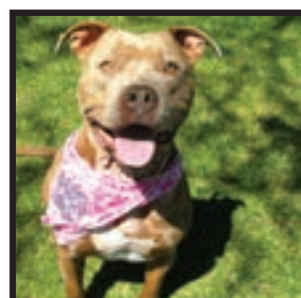
Shotzie, 4-year-old male Pit Bull mix. Kennel #2

My former owner moved to a new home that doesn't allow pets, but a guy like me shouldn't have much trouble finding that special someone to call my own. My ideal owner will be loving, caring, and kind. The shelter staff thinks that I may have been house trained already, but I might need a quick refresher course at my new home. I'm an intelligent fellow, and I'm ready and willing to learn new things. I hope you'll stop by the El Cajon Animal Shelter very soon so we can spend some time getting to know each other in the nice play yard that they have here. Just ask one of our helpful staff! I think you'll find that my happy-go-lucky, lively nature is just what you've been looking for. All my love, Rufus" Kennel #52