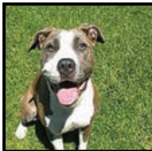
Diamond, 3-year-old Pit Bull female. Kennel #27