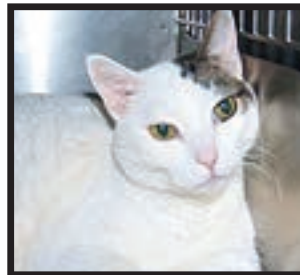
Cornelius, adult Domestic Shorthair male. Care #119