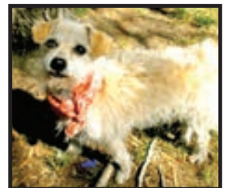
Sasha, 5-year-old Terrier/Poodle mix. Kennel #32