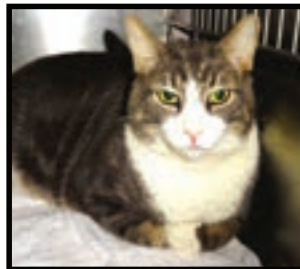
Little Bit, adult Tabby female. Cage #115