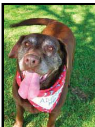
Latte, 8-year-old Female Labrador ID#15299