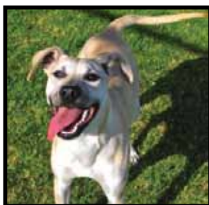
Betty, 1-year-old female Shepherd/Terrier mix ID#15201