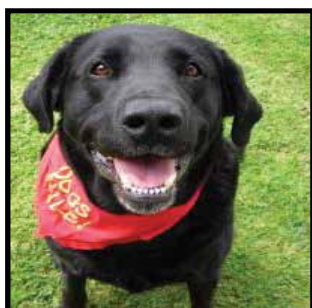
Astro, 8-year-old Male Labrador ID#15300