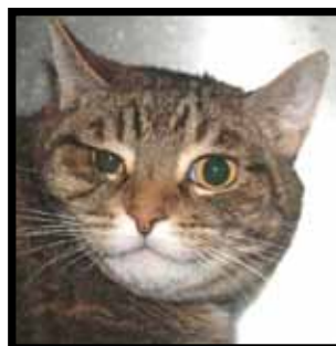
Skylar, Adult Domestic Short Hair Female. Pet ID: 15130