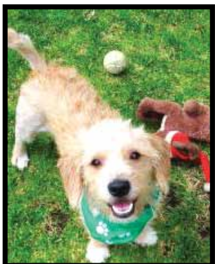
Starsky, 10-month-old terrier mix ID#15265