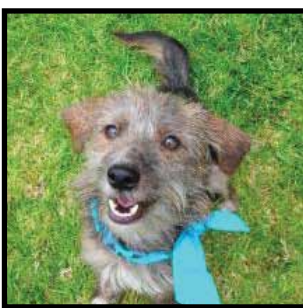
Hutch, 10-month-old Terrier mix ID#15264