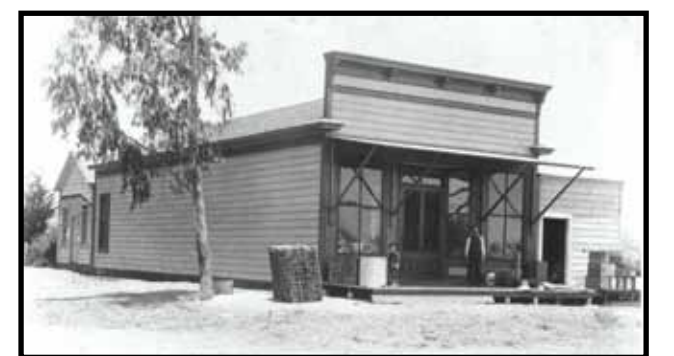
Main Street, El Cajon.