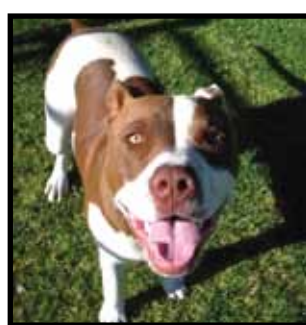
Bolt, 10-month-old Pit Bull mix. ID#1519