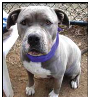
Trinity, 4-year-old Pit Bull Terrier female. ID#14247