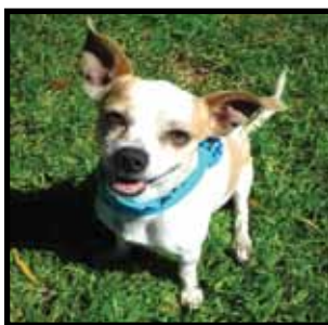
Bogey, 3-1/2-year-old Chihuahua/Jack Russell Terrier mix male. ID#13083