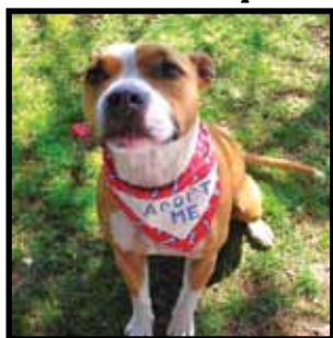
Honey, 5-year-old Pit Bull Terrier Mix female. ID#14943

Hours are Tuesday through Saturday 10 a.m. to 5 p.m.