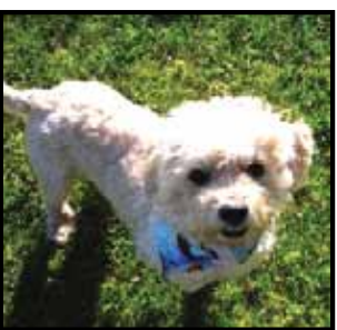
Larry, 3-year-old male poodle/terrier mix ID#15091