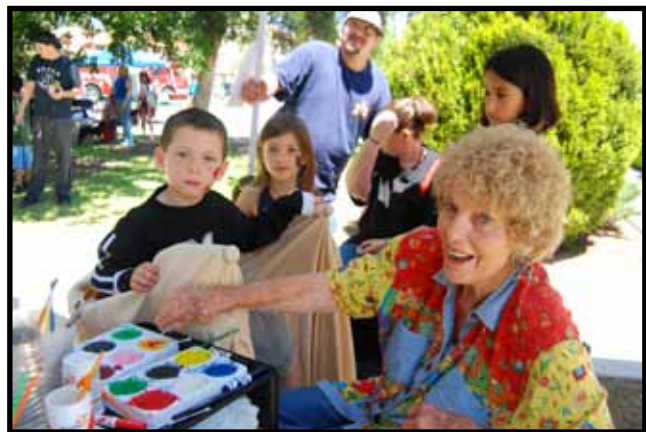
Kids enjoyed face painting at the Farragut Circle Health & Safety Fair last Saturday.