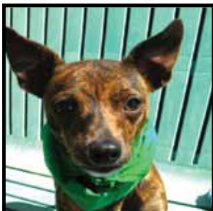
Cooper, 1-year-old Chihuahua mix male ID#13475