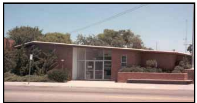
City Police and Fire Department on the corner of E. Douglas Avenue and Highland Avenue in El Cajon.