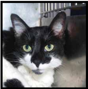
Alba, Adult Female DHS Bk & Wht ID# 15226