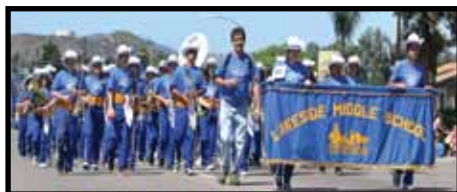
Best Band entry: Lakeside Middle School Marching Band