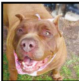
Cocoa, 5-year-old female Pit Bull ID#15095