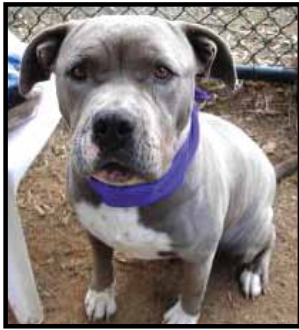
Trinity, 4-year-old Pit Bull Terrier female. ID#14247

Hours are Tuesday through Saturday 10 a.m. to 5 p.m.