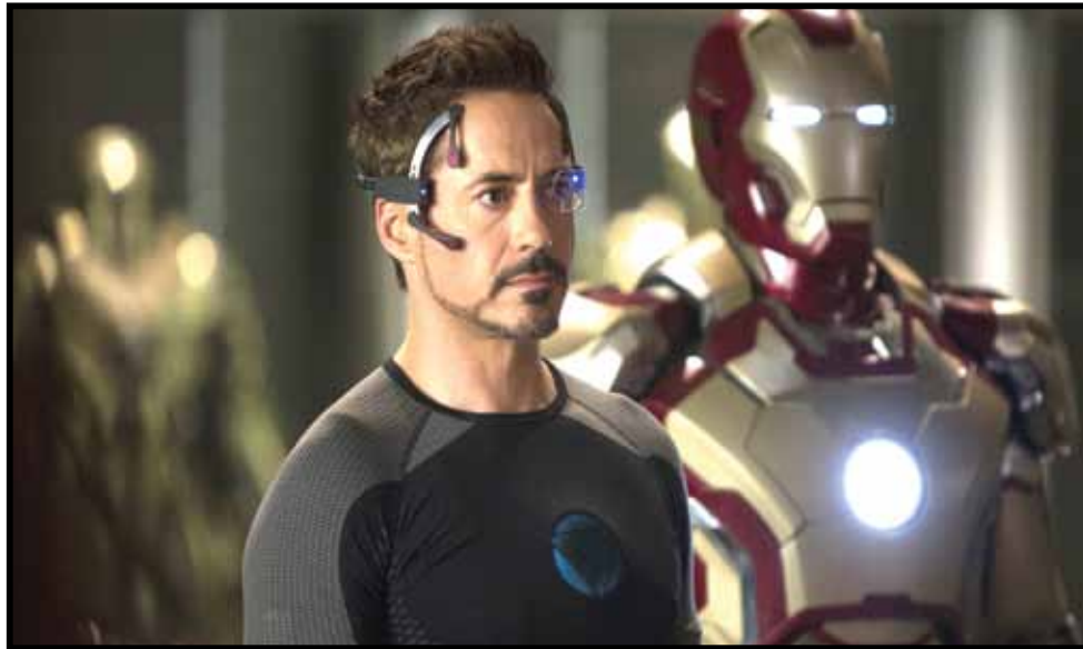
Robert Downey Jr. stars in Iron Man 3.