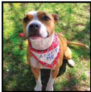
Honey, 5-year-old Pit Bull Terrier Mix female. ID#14943