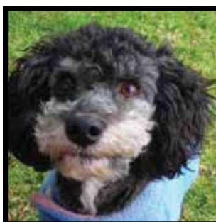
Winston, 3-year-old Poodle mix male. ID#15116