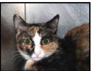
Mitzie, Young female Calico ID#15254