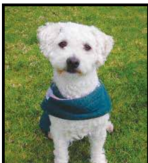
Teddy, 2-year-old Poodle Male ID#15083