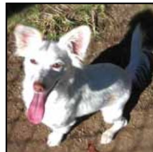
Sparkle, 9-month-old Chihuahua mix female. ID# 13097