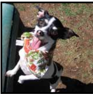
Chloe, 3-year-old Rat Terrier mix. ID 14825