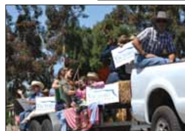
Best Musical entry: Victory Baptist Church