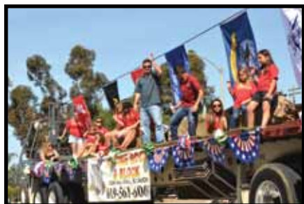
Best Youth entry: Alpine Rock & Block and Liverpool Soccer Club