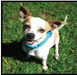
Bogey, 3-1/2-year-old Chihuahua/Jack Russell Terrier mix male. ID#13083