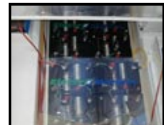
Hull of boat shows standard deep cell lead acid batteries.