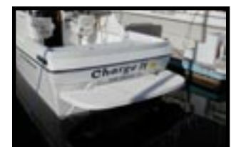
Back of 'Charge It.'