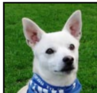
Adoptable pets . . . page 15

INSIDE THIS ISSUE Local ..... 2-6 Health ..... 7 Sports ..... 8-10 Legals..... 11-13 Class Act.... Section B