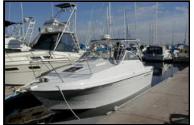
Electro Mariner.

Well when I arrived at the Harbor we all got together chatted a little then walked down to the dock, found the "Charge It," removed the tie ropes, climbed on board, met the captain of the "Charge It," chatted a little, turned on the key, put it in reverse and backed out of the slip and headed out! That was it, no inspections no fear of fuel leaks just get aboard and go!