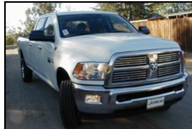
2010 Dodge Ram SLT 2500.

Of course, there is A/C, a killer sound system with satellite radio, and in the back area there are storage boxes in the floor to keep loose items from rolling around. There is a trip computer and an information center to keep driver in tune with his/her Ram truck.