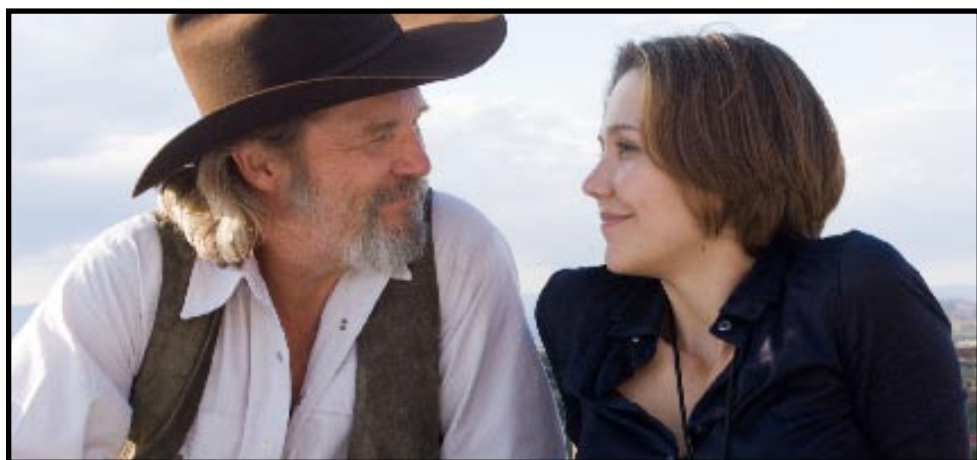
Jeff Bridges and Maggie Gyllenhaal star in Crazy Heart.