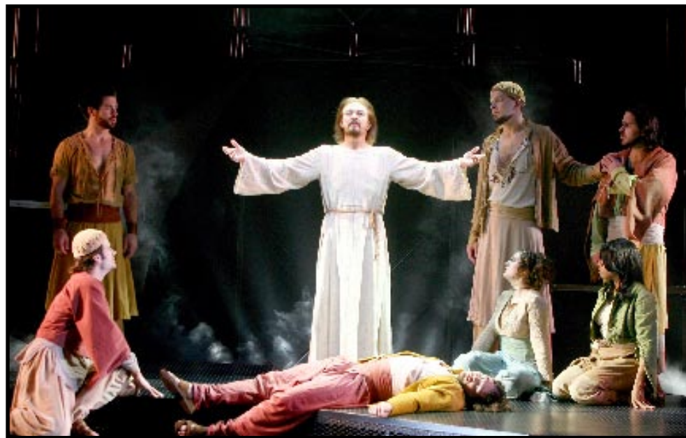
Ted Neely and Jesus Christ Superstar ensemble.